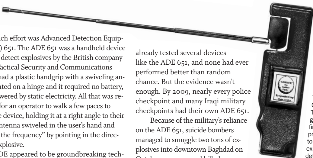
The Quadro Tracker golf ball finder, the predecessor to the ADE explosives detector.

If enough people join the collective stand against bullshit, our world will become a very different place. We won’t have to listen to people talk about things they know nothing about. We won’t be exposed to baseless arguments. We won’t have to rely on incompetent people trying to do important jobs. Rather, we will collectively replace bullshit with evidence-based communication and reasoning, making more rational decisions based on facts, evidence, and reality. S