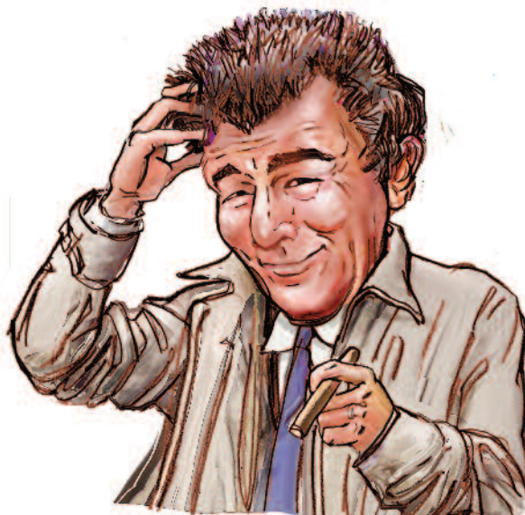
JUST ONE MORE THING...

My ideal bullshit detector is Lieutenant Frank Columbo, played by Peter Falk in the 1970s television